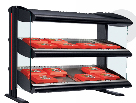
Model: HZMS-36D with dual slant shelf