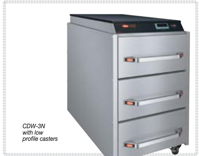
CDW-3N with low profile casters