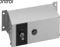
RMB-3F with toggle switch and indicator light