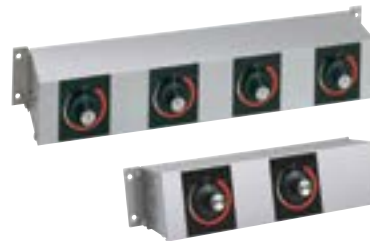
RMB-14E with infinite controls