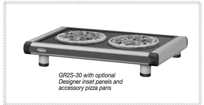
GR2S-30 with optional Designer inset panels and accessory pizza pans