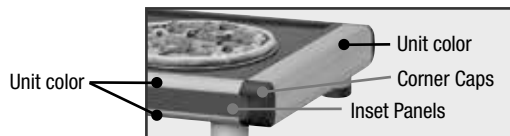
Unit color Unit color Corner Caps Inset Panels