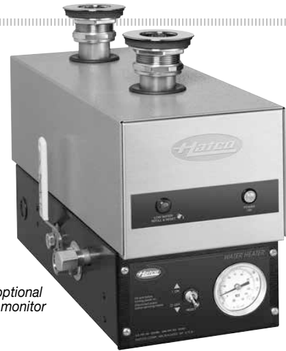
3CS-9 with optional temperature monitor