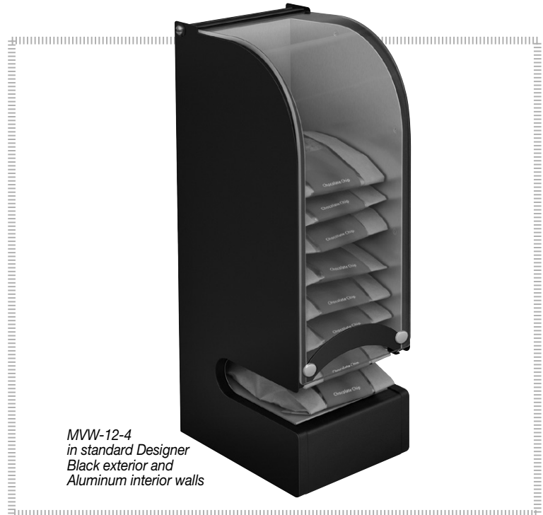
MVW-12-4 in standard Designer Black exterior and Aluminum interior walls