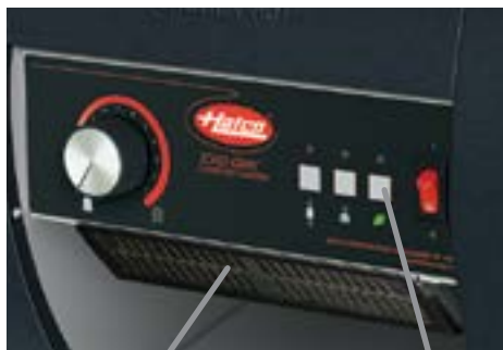
Air Intake Filter Screen